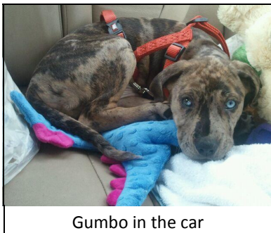
Gumbo in the car

Four-day old Gumbo was left at a county animal shelter with his mother and six brothers and sisters. That was the beginning of Gumbo's Big Adventure.