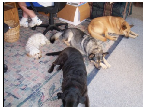
Ginger with the big dogs at Mary Ellen's house

Ginger had been terribly misunderstood during those five months in 2007, but patience won out and Ginger and Prudence finally found each other. The perfect match!