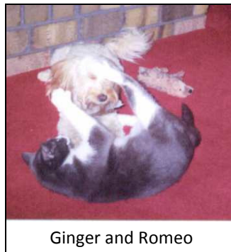
Ginger and Romeo

Sure enough, this big dog in a little dog's body made herself right at home from the first moment. No baby gate was keeping her from the